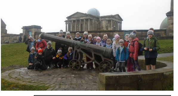
Taking in the views on Colton Hill

Indoor Athletics Competition; Class 3 are off to Bowness as part of their learning in geography; Class 2 will be sharing their learning at their special assembly next